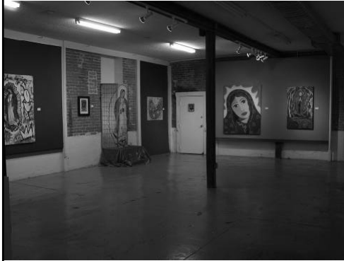
Ice House Cultural Center 1004 West Page Avenue Dallas, Texas 75208

City of Dallas Asian American Cultural Center AACC