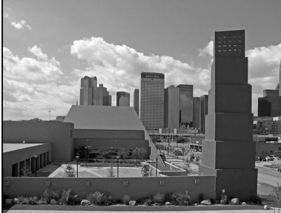
Latino Cultural Center 2600 Live Oak at Good Latimer Dallas, Texas 75204

City of Dallas Asian American Cultural Center AACC